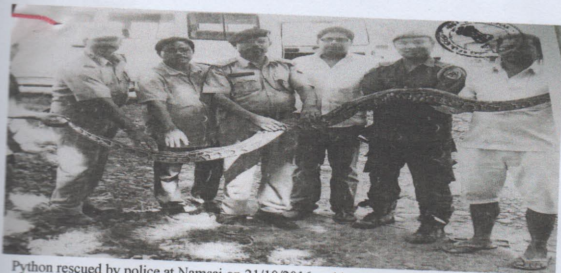
Python rescued by police at Namsai on 21/10/2016 and handed over to Mini Zoo, Miao.